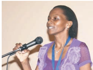
Colloquium Strengthens Capacity Gaps | Pg 3