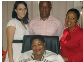
SAQA Board Reaccredits LGSETA | Pg 3