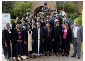
AAT Partnership for Accounting Empowerment | Pg 4